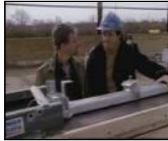
Kevin Whately in "Off Your Trolley"