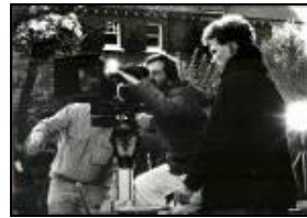
Filming "Love me Leave me" 35mm Feature Film

"Touching Stories" , a documentary about a charity who produce paintings for the blind, segments for Sky's "The Really New HD Show" and a series of High Definition commercials for the perfumes "TNT" and "Ammo" . Charles was both Director and DOP on the documentary and the commercials. He also completed some of the green screen sequences featuring the late Peter O'Toole on the 3D feature film "Eldorado" (DOP).