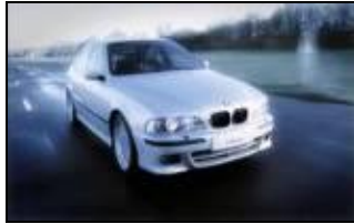
BMW "On Track" DVD's