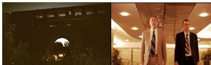
Recon of the Train Robbery 1963